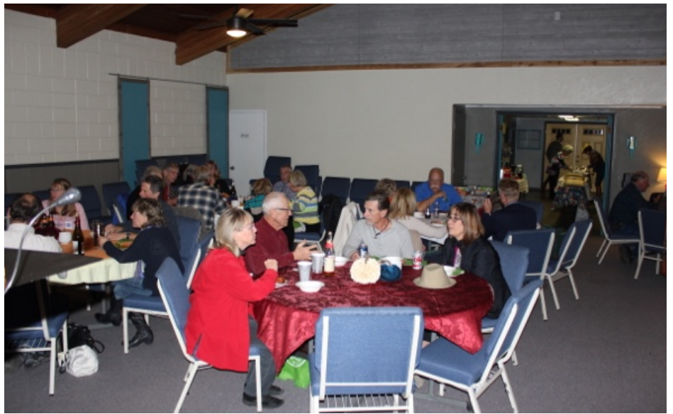
Enjoying good food and fun fellowship is really what it's all about!!