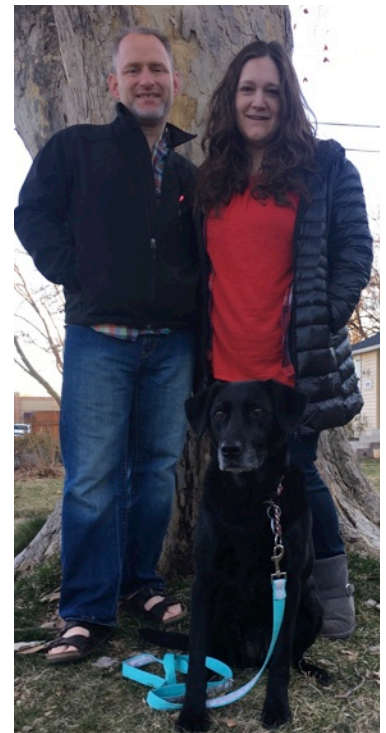
Loretta's ready for some camping! Are you?