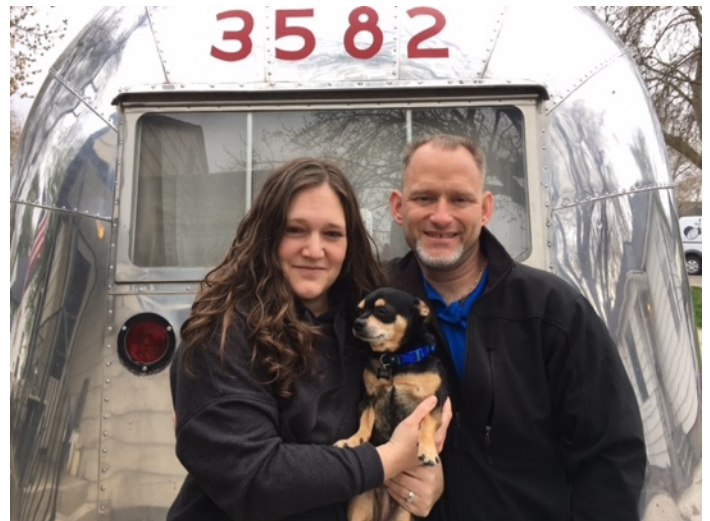
Blu the chihuahua mix is the most recent addition to our family... she'll be at the April Rally too!