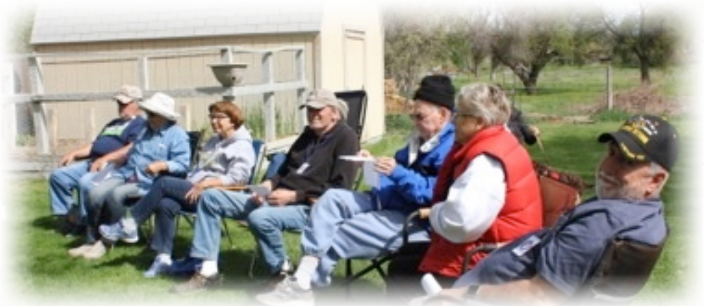
Group attending the Canada's "new member" seminar