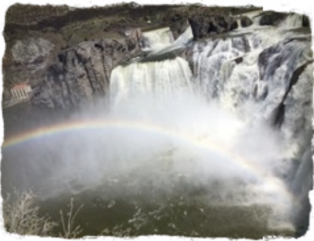
Ellie Goedeking's photo of Shoshone Falls