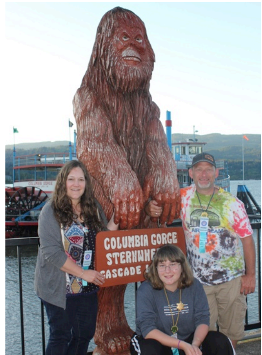
Our family (posing with our new buddy Big Foot) really enjoyed the dinner cruise on the Columbia aboard the Sternwheeler at the Region 10 Rally. Thank you Airstream Adventures NW!!