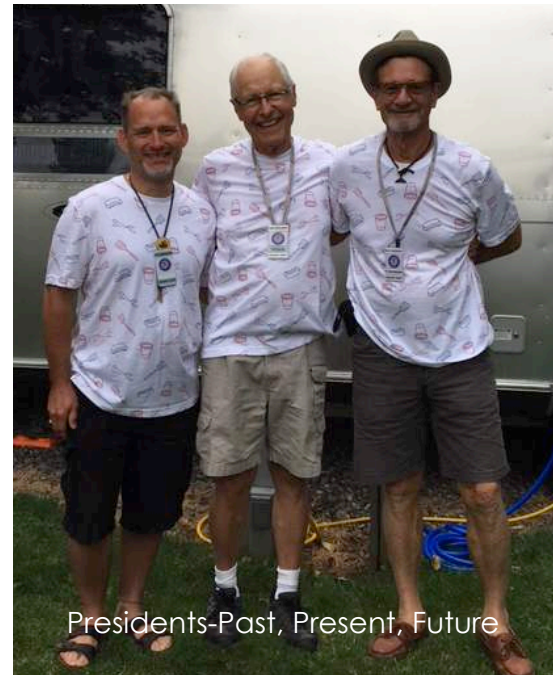
Presidents-Past, Present, Future