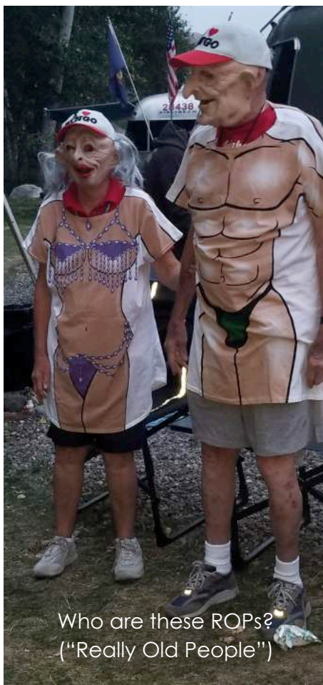
Who are these ROPs? ("Really Old People")