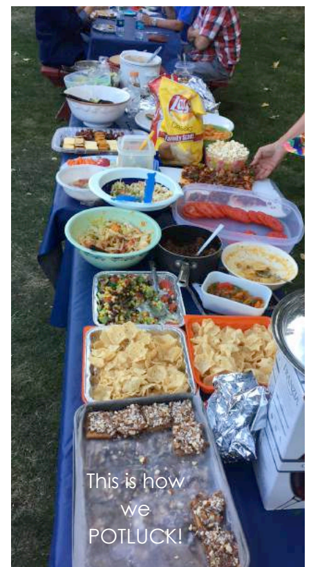
This is how we POTLUCK!