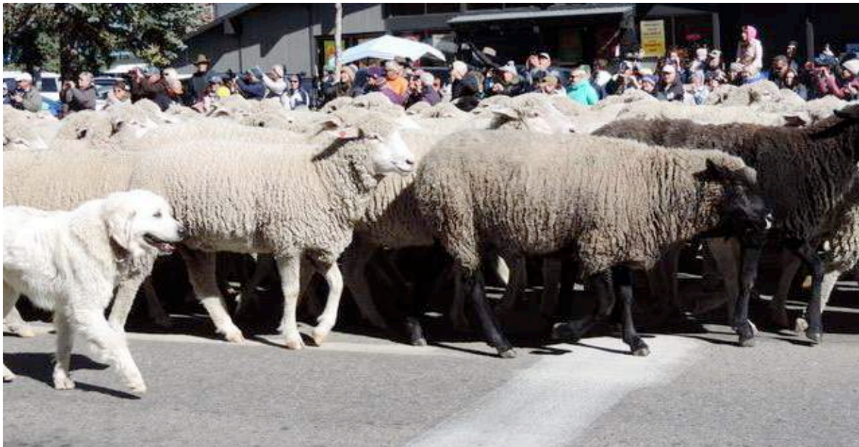
Trailing of the Sheep Rally