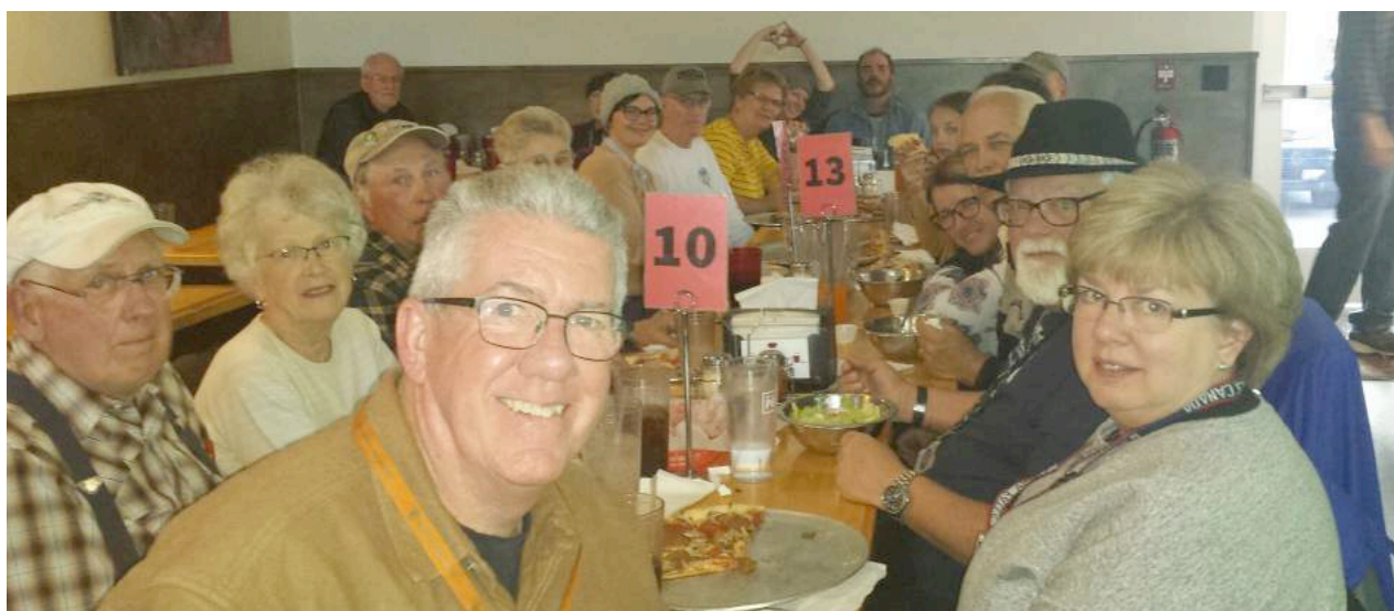
Pizza Dinner in Hailey

We hope all had fun, enjoyed the festival and, while we didn't all go to the same things at the same time, we are sure most had the opportunity to fully engage in the many activities that are offered at the festival.