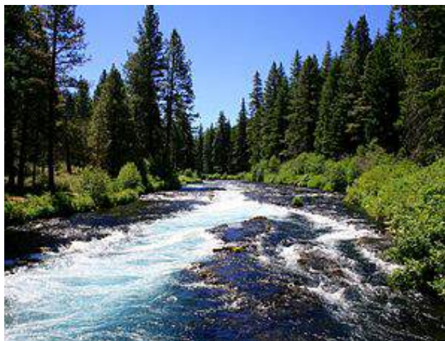
The spectacular Metolius River – On the Agenda!

Date: May 16 – 20, 2019 Bend/Sisters Garden RV Resort 67667 Hwy 20 Bend, OR 97701 (541) 549-3021