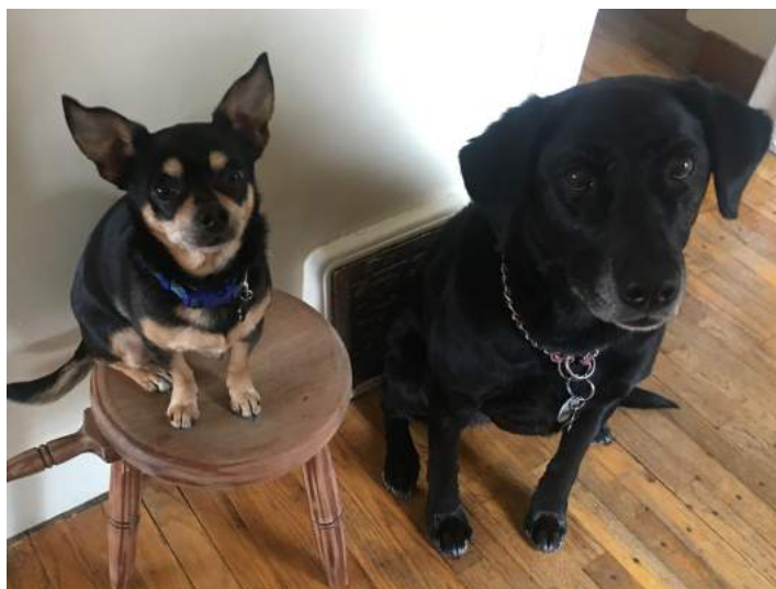
Blu the Chihuahua (7) and Loretta the Lab (9)