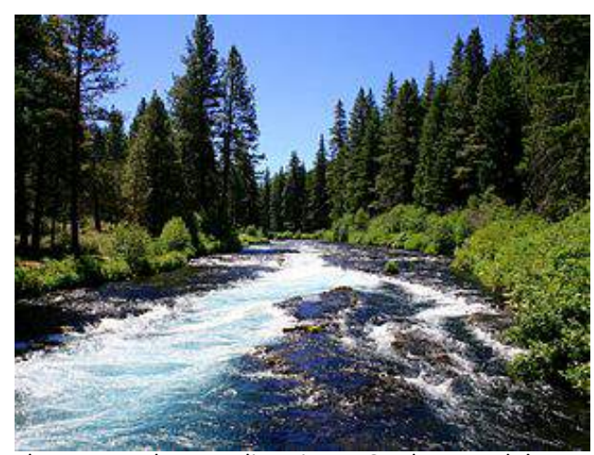
The spectacular Metolius River - On the Agenda!

Date: May 16 – 20, 2019 Bend/Sisters Garden RV Resort 67667 Hwy 20 Bend, OR 97701 (541) 549-3021