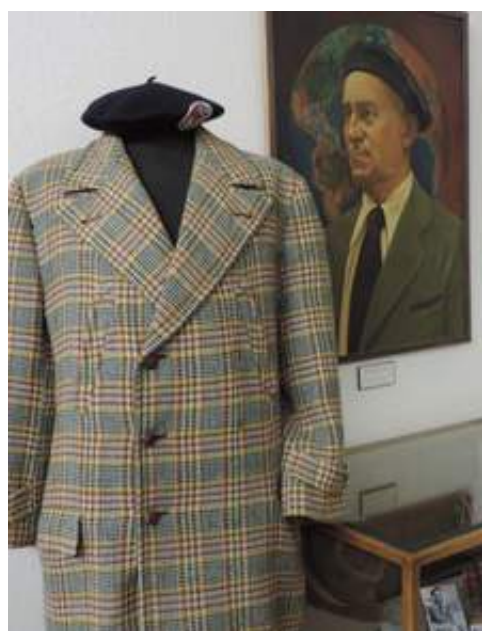
Wally's Display at Baker Heritage Museum