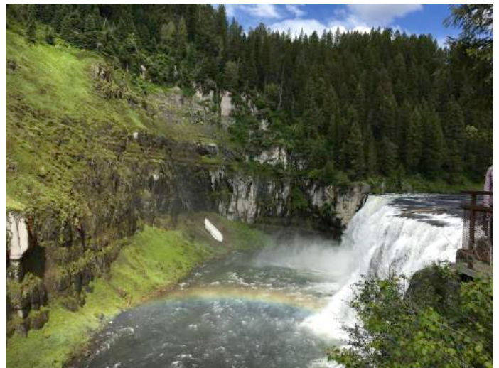
The beauty of Upper Mesa Falls