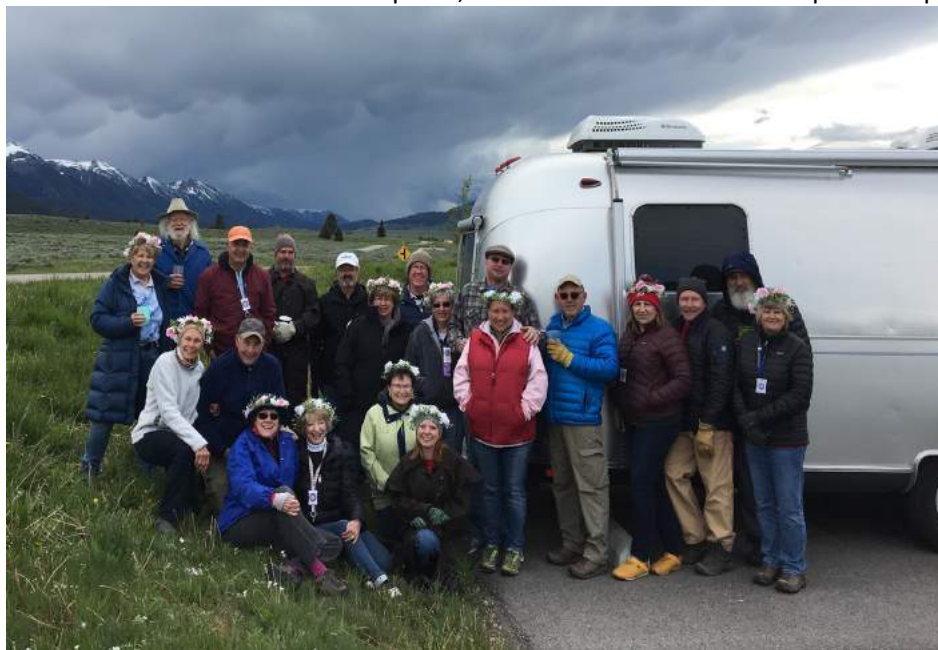
Celebrating Summer Solstice in Idaho with fleece and down!

Friday (the summer solstice) started cold and clear. Breakfast items (and flower crowns) were delivered to each Airstream. The park rangers invited us to participate in a Solstice Welcome before we headed to Quake Lake where we were greeted with wind, rain, snow and colder temps. Some of us returned to explore the Island Park Valley while others took the Hebgen Lake road and came home via West Yellowstone. For Happy Hour, we donned our flower crowns, toasted summer's arrival with aquavit, and did not let weather dampen our spirits!