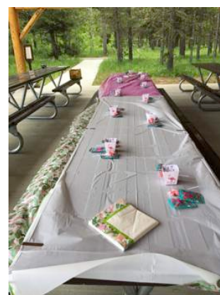
Pink Flamingo Day!!

The Hickenloopers and the Schanzes making the park a cleaner place!