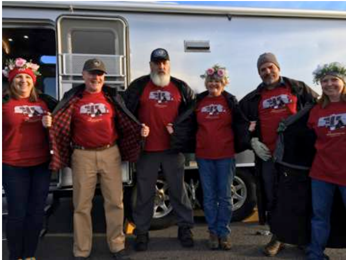
See what they found in West Yellowstone!