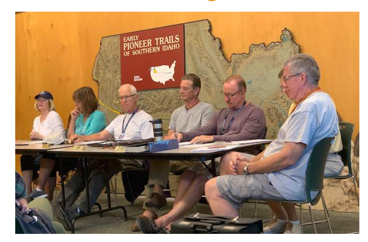
2018-19 Board at Business Meeting