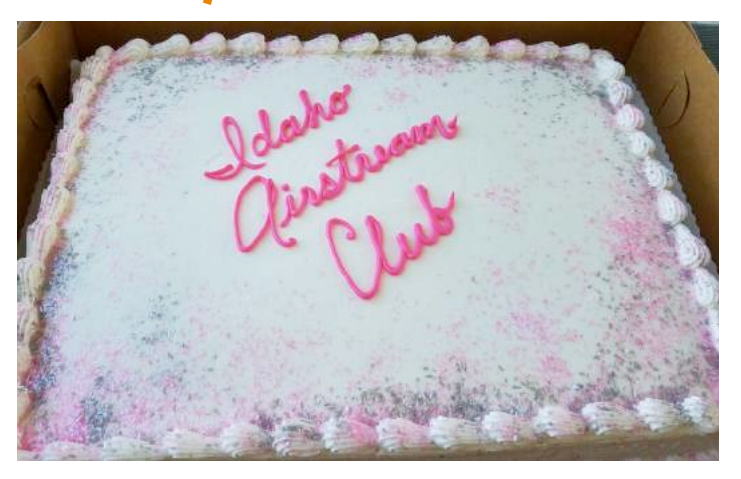
Installation Reception Cake!