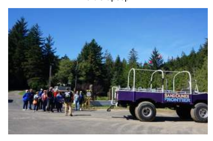
Sand Dunes Frontier sand dunes tour