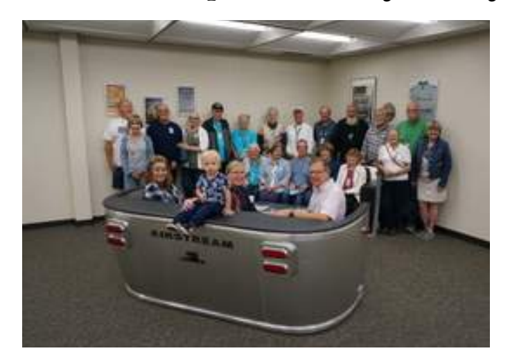
The group at Ultimate Airstream