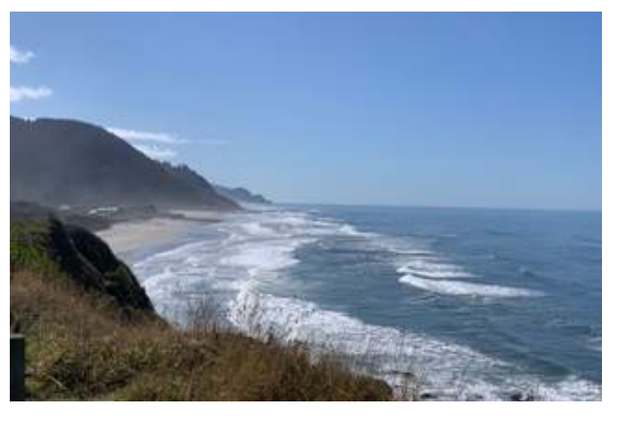
Central Oregon Coast