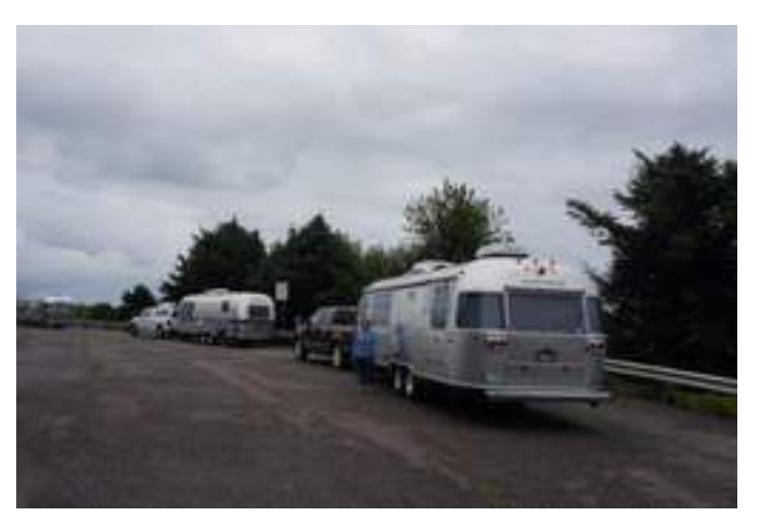
Pullout along the Coast