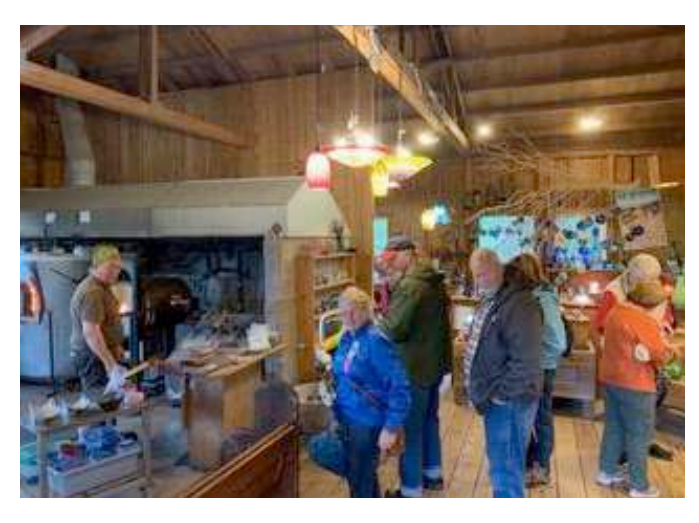
Alder House Glassblowing studio in Lincoln City